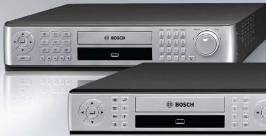
Video Recorder 400 Series for applications up to 4 cameras