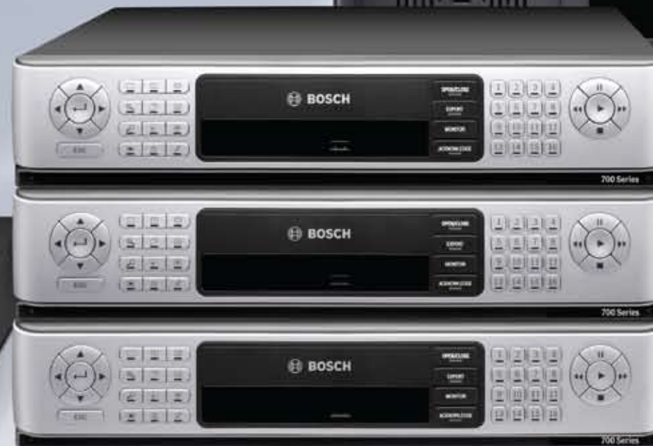
Divar Hybrid and Network Recorder 700 2) Series for demanding system applications