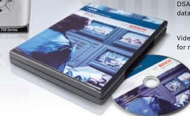
Video Recording Manager (VRM) software for maximum control and scalability