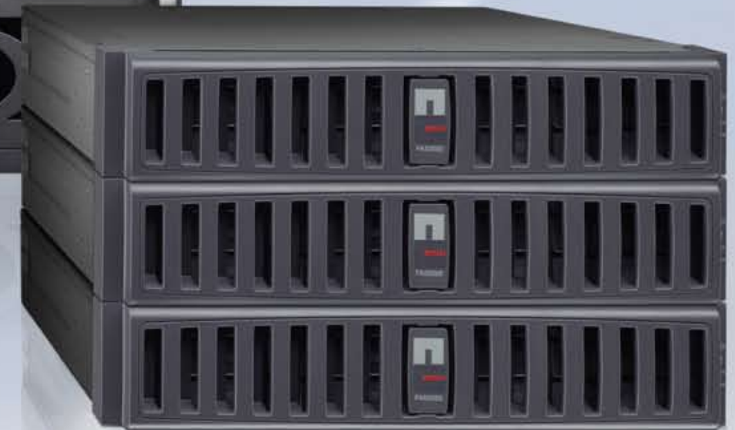
DSA Series iSCSI Video Storage Arrays for highest data availability