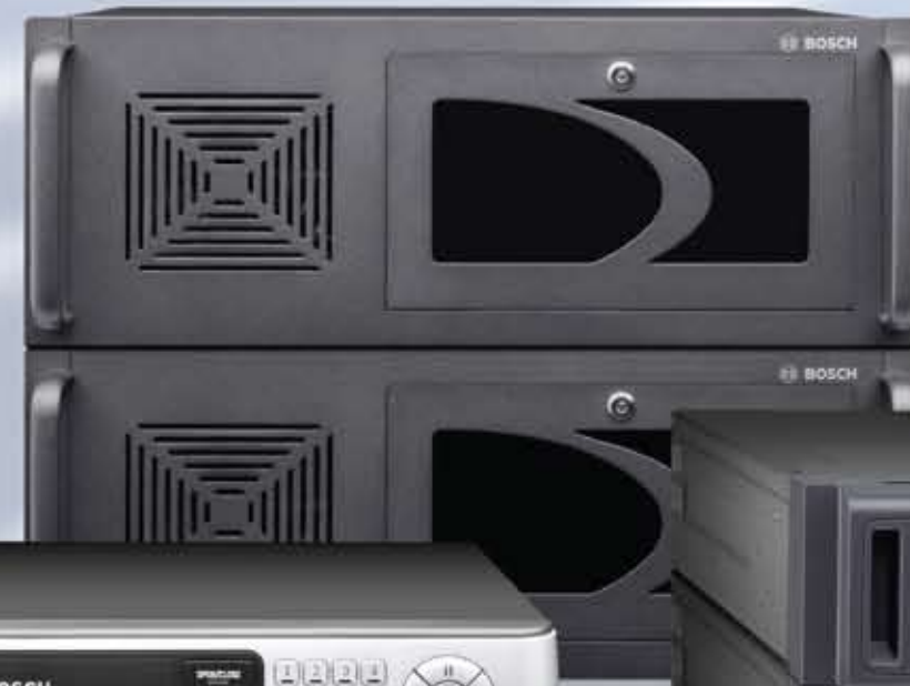
Dibos Hybrid Recorder 900 Series for customized security